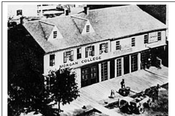
Morgan College as it looked when it occupied the site of the new American Stores tower

At its peak, Morgan College had 700 students, compared with the University of Deseret's meager 200. As principal, Morgan freely spread such pithy words of wisdom as: "Do not allow the long winter evenings before you to be thrown away; or worse, do